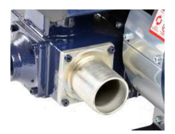
Bolt-on hose barbs flanges for ease of installation