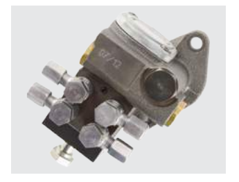
Automatic adjustment free mechanical oil pump